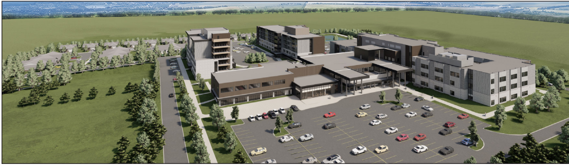
The design and construction of the redevelopment of the Simcoe Village Campus in Beeton continues in 2026 (rendering above).