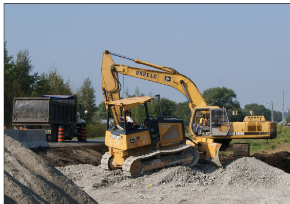
County Capital projects expenditures include a number of road and bridge rehabilitation and construction projects.

The 2023 capital budget includes construction and road maintenance projects totalling $47M. Capital projects expenditures include the continued construction of County Road 21 (Innisfil Beach Road), County Road 4, the trail construction on the Barrie Collingwood Railway (BCRY), as well as a number of other road and bridge rehabilitation and construction projects.