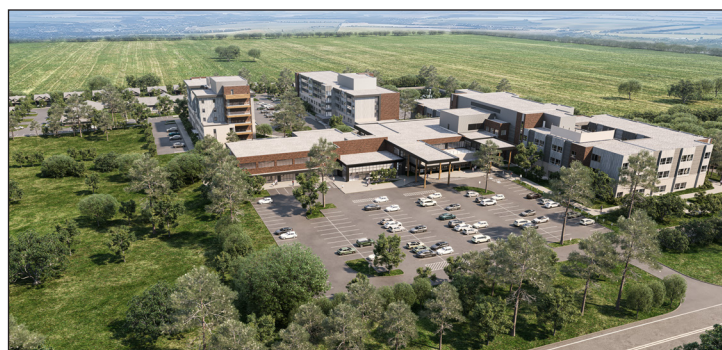
The budget includes funds to continue the planning and design phase for redevelopment of the Simcoe Village campus. (rendering above).

For 2023, the County's Canada-Wide Early Learning and Child Care Provincial / Federal Agreement allocation totals $100.5M.