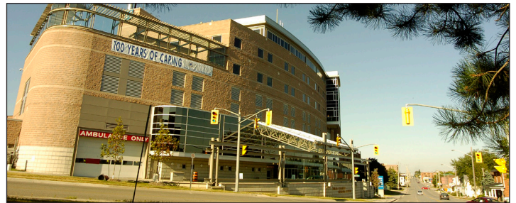
County Council continues its major financial commitments to local hospitals, such as Orillia Soldiers' Memorial Hospital (bottom right), Simcoe Muskoka District Health Unit, hospice (Matthews House in Alliston, top right), transportation, and post secondary education institutions, such as Georgian College (left).