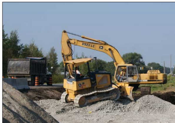
County Capital projects expenditures include a number of road and bridge rehabilitation and construction projects.

The 2023 capital budget includes construction and road maintenance projects totalling $47M. Capital projects expenditures include the continued construction of County Road 21 (Innisfil Beach Road), County Road 4, the trail construction on the Barrie Collingwood Railway (BCRY), as well as a number of other road and bridge rehabilitation and construction projects.