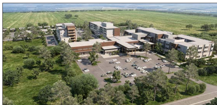
The budget includes funds to continue the planning and design phase for redevelopment of the Simcoe Village campus. (rendering above).

For 2023, the County's Canada-Wide Early Learning and Child Care Provincial / Federal Agreement allocation totals $100.5M.