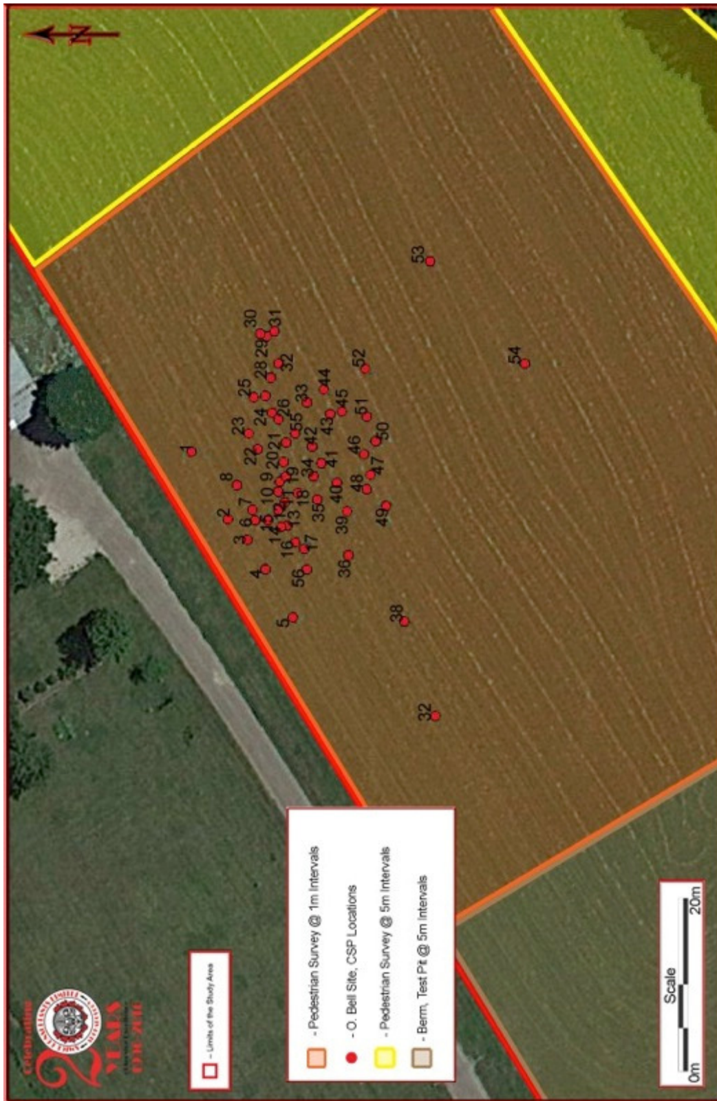
FIGURE 9 AERIAL IMAGE OF THE LOCATION OF THE O. BELL SITE (BCGV-44)