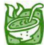
The Sharing Place Food Bank