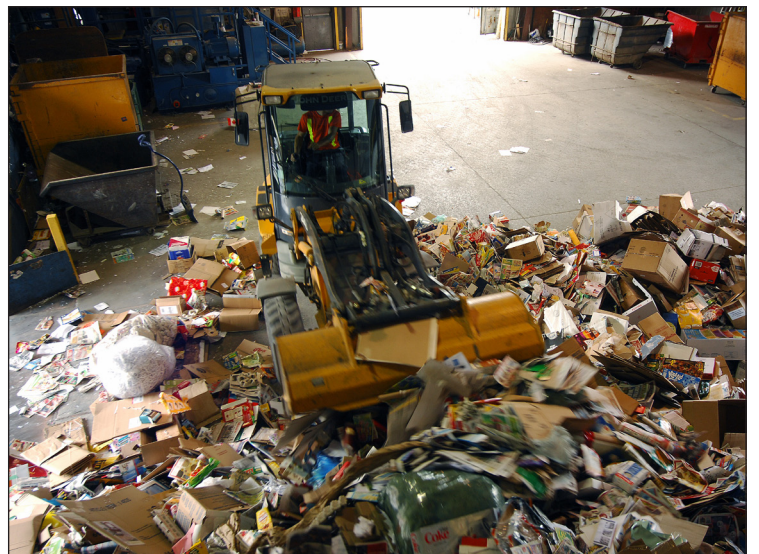
Solid Waste Management capital projects include equipment replacement and site improvements at the North Simcoe and Mara Transfer Stations.

Capital projects include equipment replacement, site improvements at the North Simcoe and Mara Transfer Stations (52 and 7), as well as the purchase and distribution of carts for the new collection contract commencing in November.