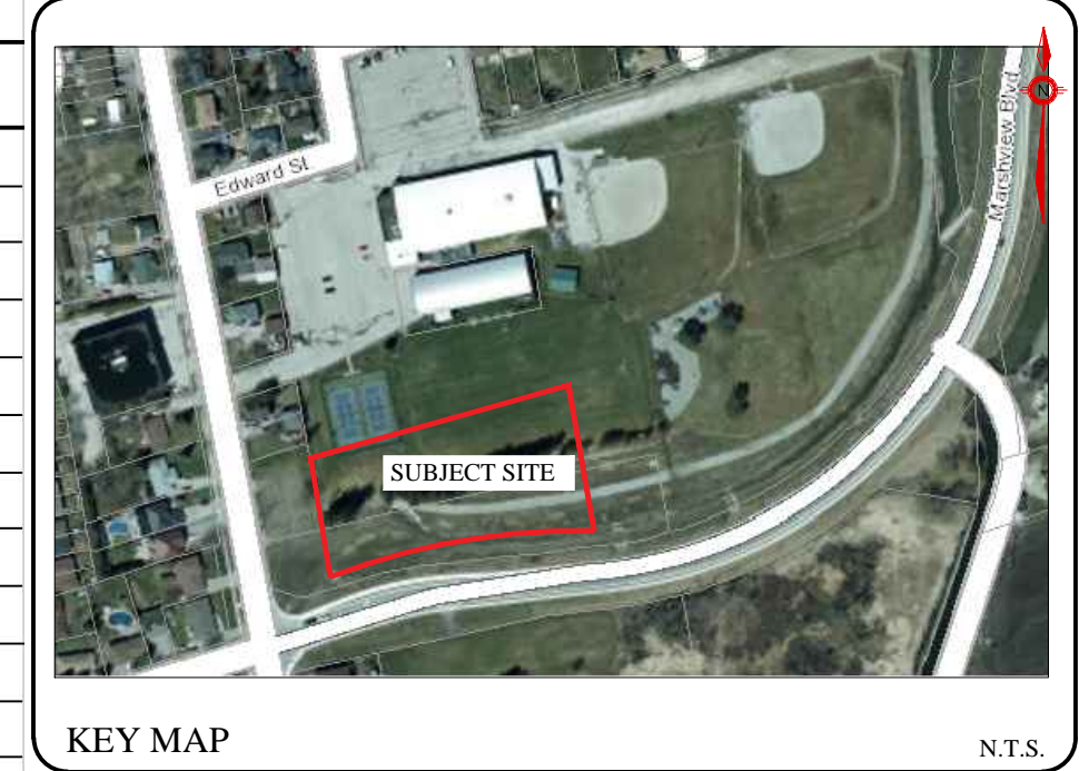
KEY MAP N.T.S.