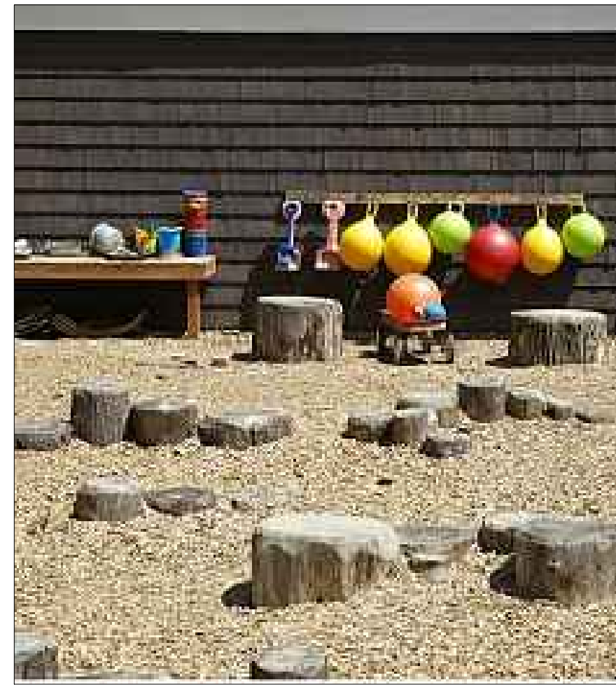
PLAYGROUND SURFACE WITH EWF