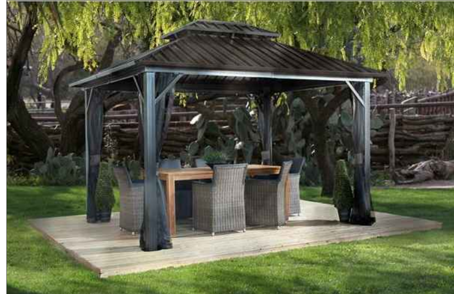
12X12' GAZEBO WITH ALUMINUM FRAME