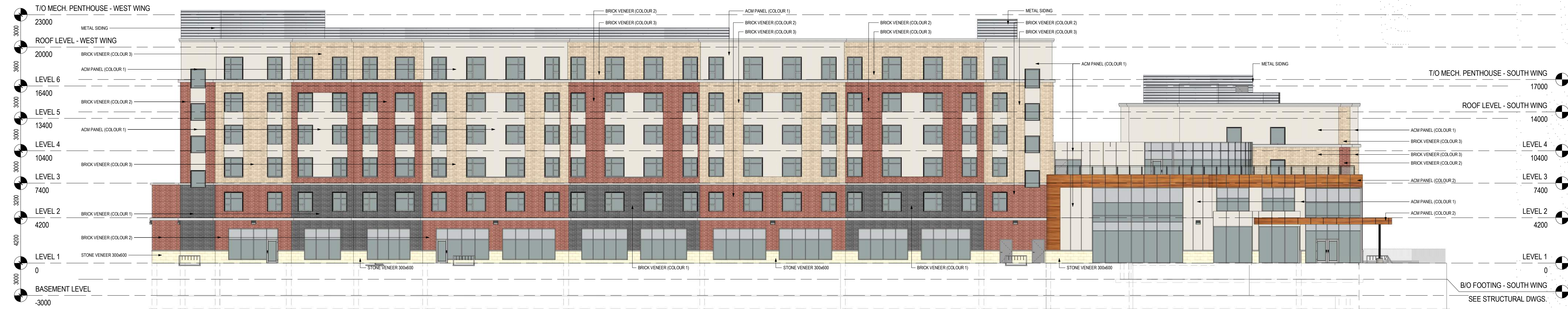
WEST ELEVATION 1:200