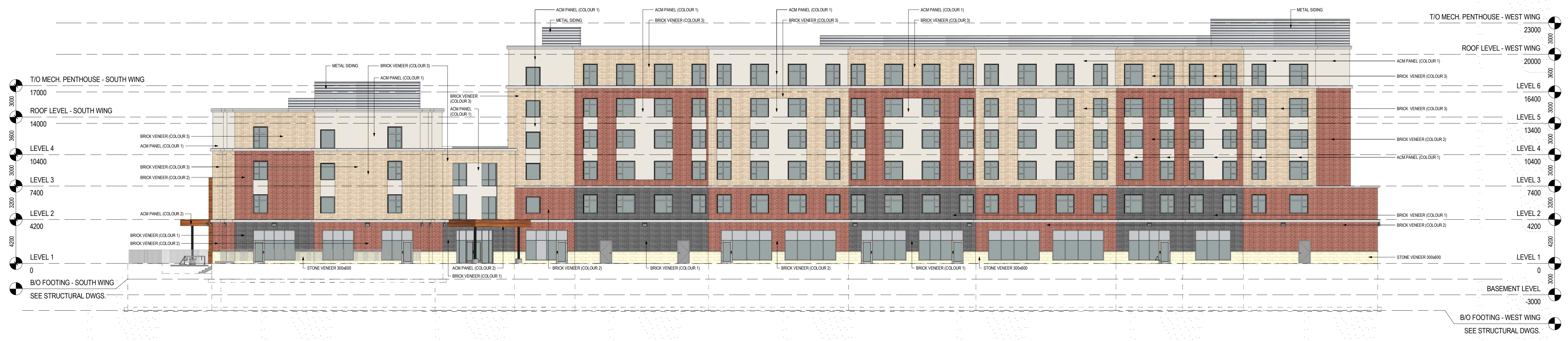
EAST ELEVATION 1:200