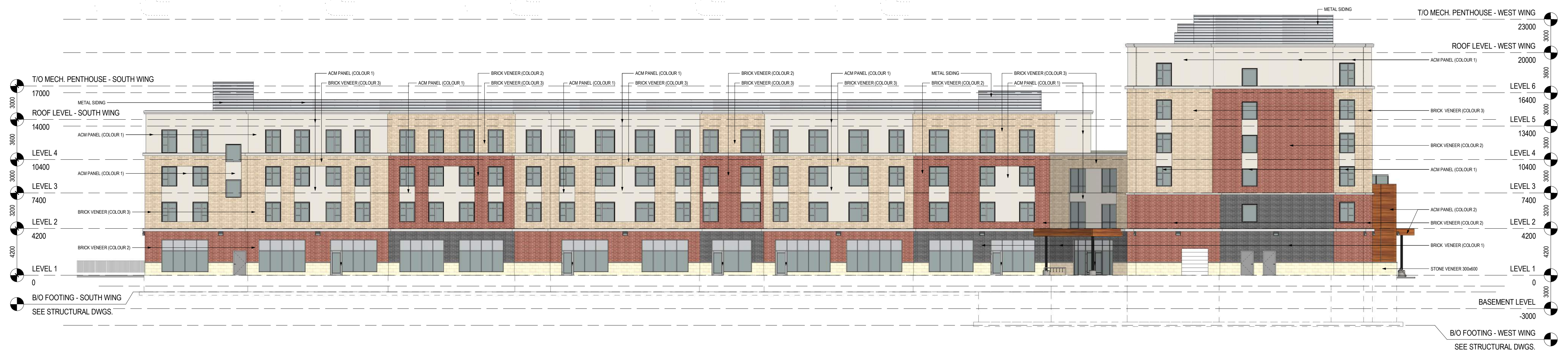
NORTH ELEVATION 1:200