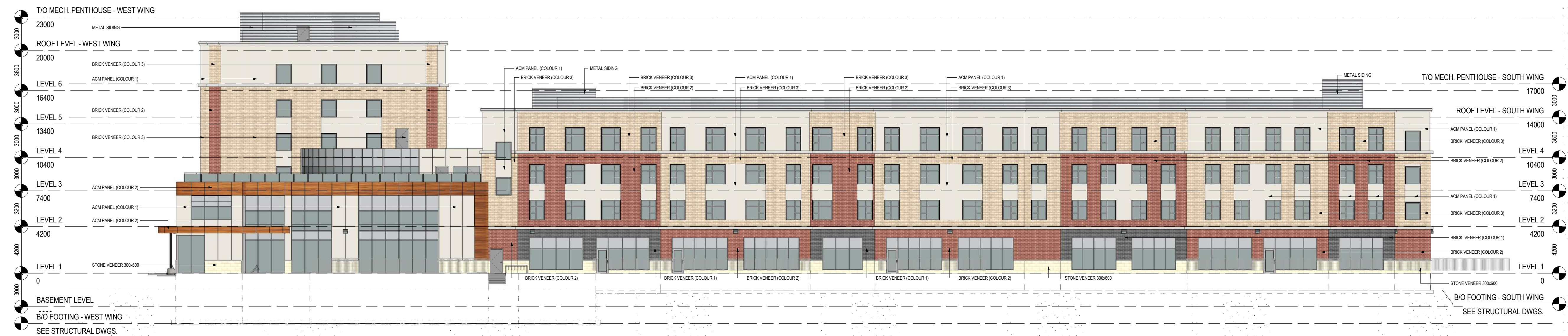
SOUTH ELEVATION 1:200