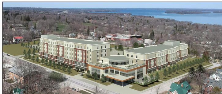
The County has invested more than $300 million towards the creation of affordable housing since 2014, including the soon-to-open Orillia hub development project (rendering above).

with improved access to quality, inclusive, and affordable child care.