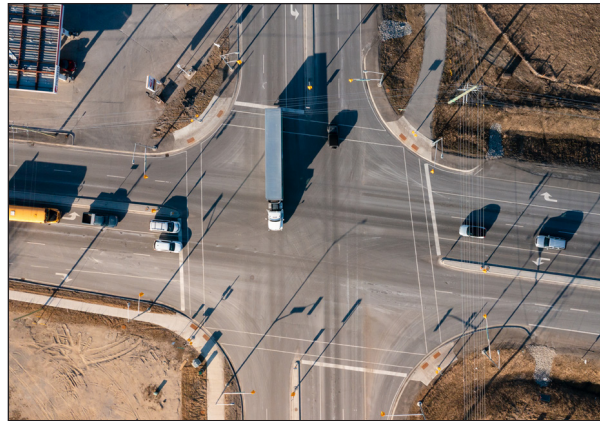
County Capital projects expenditures include a number of road and bridge rehabilitation and construction projects.

The 2024 capital budget includes construction and road maintenance projects totaling $47M. Capital project expenditures include the continued construction of County Road 21 (Innisfil Beach Road), County Road 4, construction of the Matheson Creek bridge as well as a number of other road and bridge rehabilitation and construction projects.